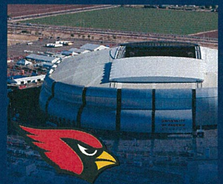
UNIVERSITY OF PHOENIX STADIUM Financial/ Market Advisor for New Stadium Development Options