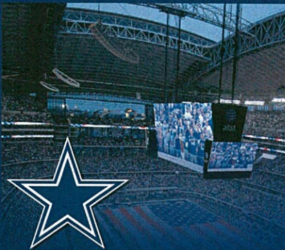
AT&T STADIUM Advisor/ Sales Execution for New Stadium