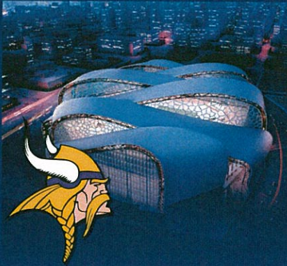
MINNESOTA VIKINGS STADIUM New Stadium Consultant

Our team has been involved in over 1,000 engagements over the past 20 years. Our team has been involved in every major US large stadium project. Specific U.S. stadium developments such as: