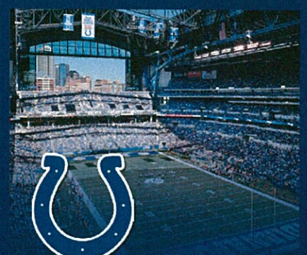
LUCAS OIL STADIUM New Stadium Consultant