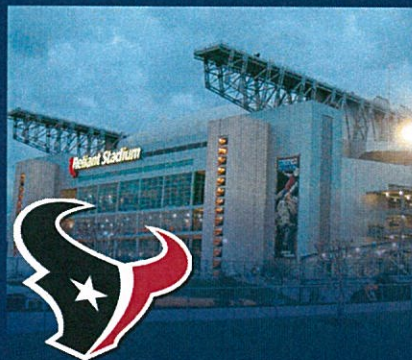
RELIANT STADIUM New Stadium Consultant