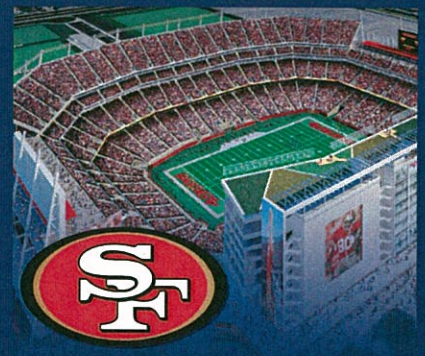
LEVI'S STADIUM Financial/ Market Advisor for New Stadium, Sales Execution