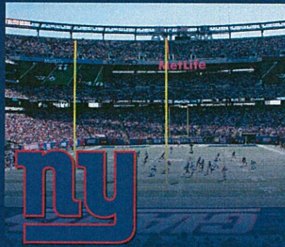
METLIFE STADIUM Advisor/ Sales Execution for New Stadium